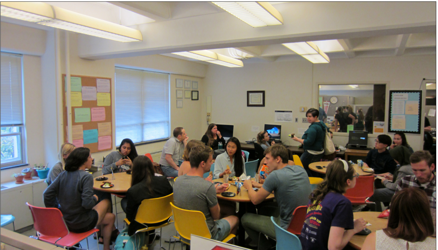
Food and conversation at last semester's all-staff meeting.